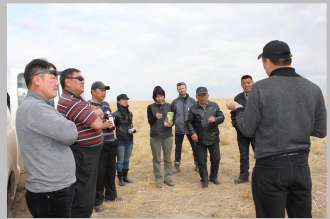
Visit to our Agricultural Customer “Munkh Tal LLC” in Dornod Aimag, Khalkh Gol Soum. Munkh Tal LLC is engaged in crop production, producing wheat.

Wagner Asia has successfully participated in “Nar Tosson hugjil” day event of the “Khalkh Gol” project in the Khalkh Gol Soum of Dornod aimag. The event was organized by the Ministry of Food, Agriculture and Light industry. The “ Khalkh Gol Project ” is a Government Program, initiated in 2010; the project duration is for 7 years during 2010 – 2016. Project is aiming to increase national crop production, improve both food supply and food safety and decrease import dependency of major foods. The total twenty three base researches have been carried out and 191.773 ha land has been identified as suitable for Crop Production in the eastern “Dornod” aimag.